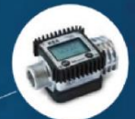
DIGITAL FLOW METERS