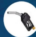
DISPENSING NOZZLE VARIATIONS

The range has an extra large equipment compartment area that can house a variety of accessories.