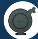
UP TO 10M OR 32FT RETRACTABLE HOSE REELS