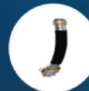
HOSES WITH ISO QUICK RELEASE COUPLERS