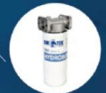
IN LINE PARTIAL SEPARATION FILTERS