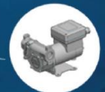
ENGINE DRIVEN OR ELECTRIC PUMPS